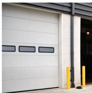
Insulated Lites allow for visibility while maintaining security