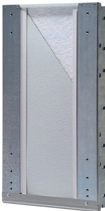
Optional polystyrene insulation sealed between door panel and embossed steel backing cuts heating/cooling cost.

Contact Wayne-Dalton for additional sizes and colors.