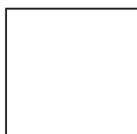
White Flush Finish