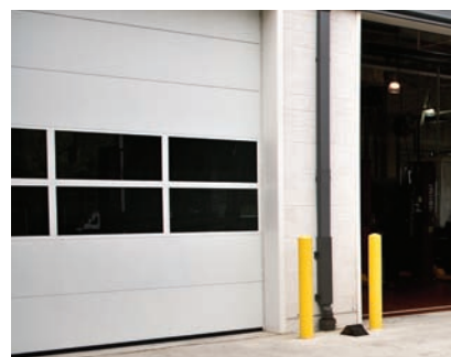
Full view sections allow for maximum natural light and visibility