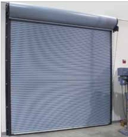
No. 2 slat.

Secur-Vent® — Perforated slat provides optimal security and ventilation. Slat consists of 1/16" diameter hole offering 20 to 25% open area over length of each slat. Available in No. 17 flat slat up to 14' wide x 12' high.