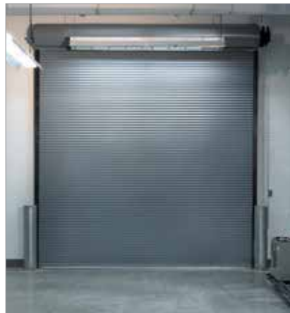
No. 17 slat.