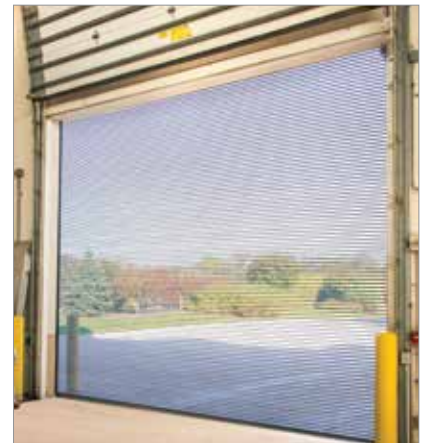
Combination door with Sectional and Upward Rolling Secur-Vent® Service Door.